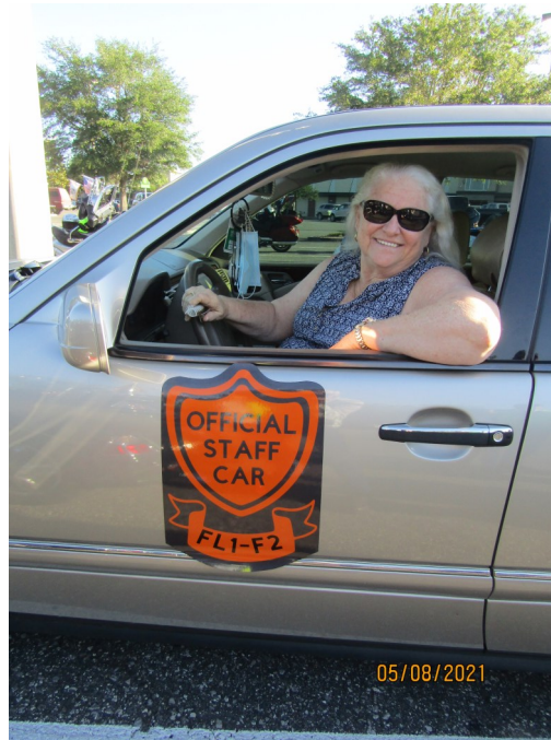
Official Staff Car FL1-F2